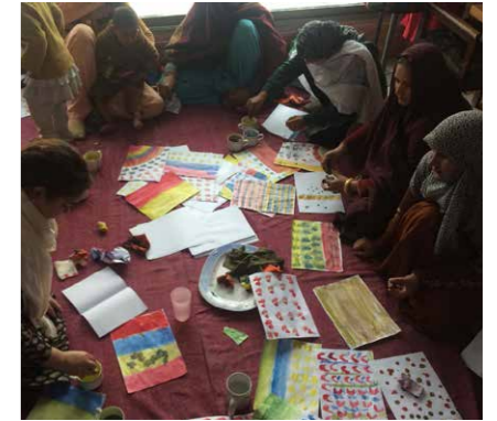
Running a print workshop on the Pakistan side of the India/Pakistan border

Protection in Contexts of Conflict and Displacement