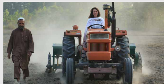
Sowing zinc- biofortified wheat in Khyber Pakhtunkhwa, north west Pakistan