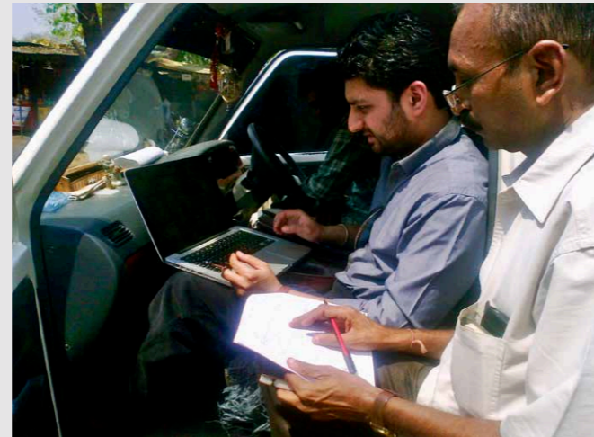
Researchers mapping service provision in low-income urban neighbourhoods in Maharashtra, India