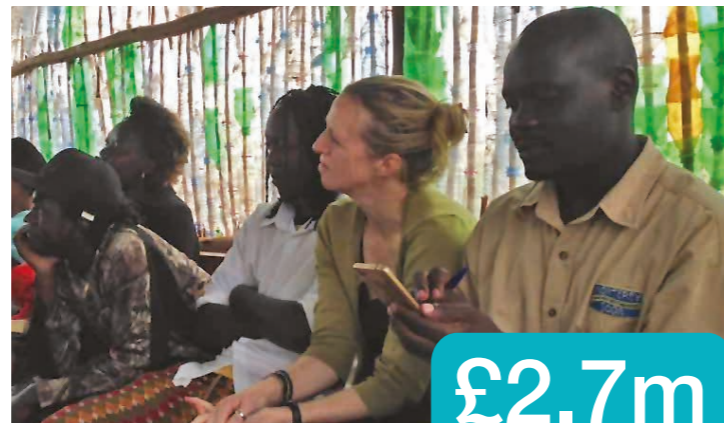
Participation in Research with Communities – Banda, an unplanned settlement in Kampala, Uganda

Bringing together clusters of GCRF and other official development assistance (ODA) oriented research projects alongside other relevant stakeholders such as NGOs, CSO, government or industry the projects – which range from optimising antibiotic use in East Africa to using the arts to improve human security in areas affected by conflict – could achieve much greater impact. The GCRF Challenge Clusters are a two-stage investment – providing seed funding for 21 initial projects over 12 months followed by second stage funding for up to 8 projects over the subsequent three years.