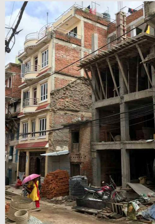
Earthquake risk in Kathmandu: research supporting socially inclusive and physically resilient reconstruction